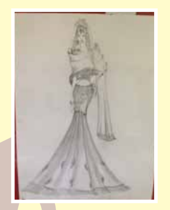
Kashish Patil (VI -A)