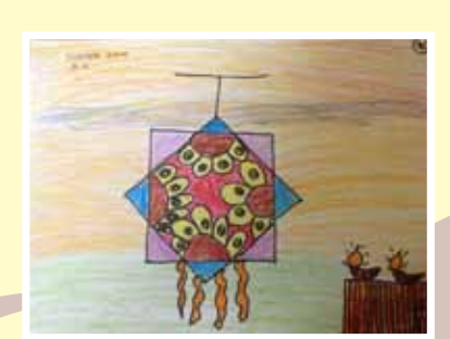
Shweta Zade (II-D)