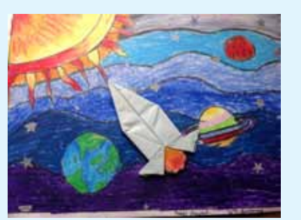
Prachi Sawant (5-Brahmos)