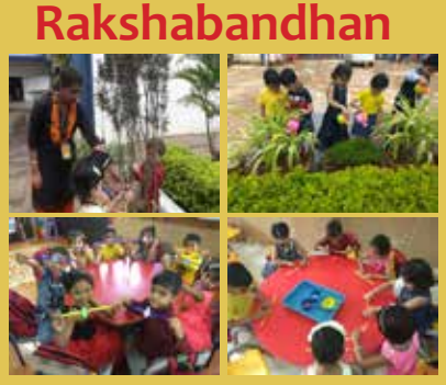
Rakshabandhan was a fun-filled day for the tiny tots as they learned how trees are useful and how to take care them.