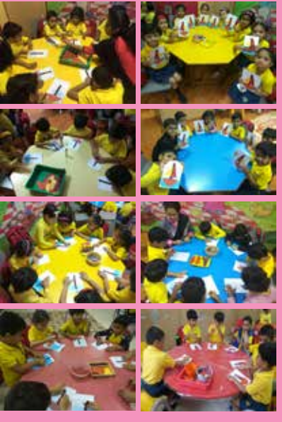
Sr. KG students enjoyed the Sail Ship Craft Making.