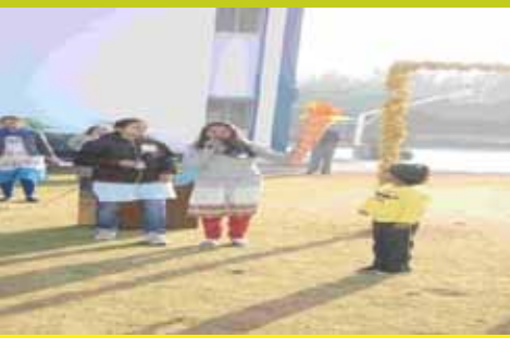
Teachers in Jumbo Kids teach concepts to children using unique teaching aids .The children enjoy demonstrations and learn better.

We do believe every child is special & every child is a winner & that is the essence that Podar Jumbo Kids truly upholds and is working on coaxing others to follow.