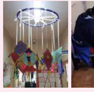
Makarsankranti was great fun as children enjoyed kite flying and made creative kites.