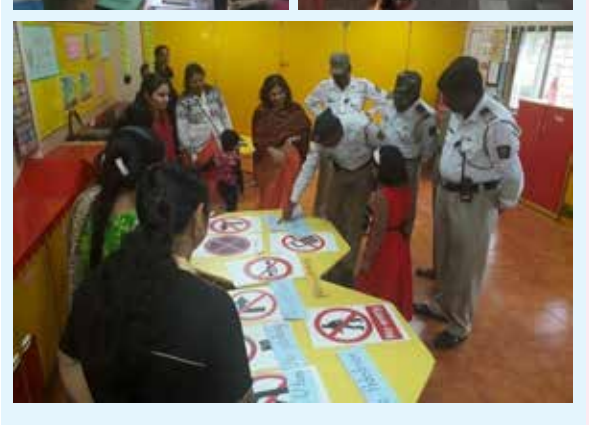
Children learned how to follow the traffic rules.