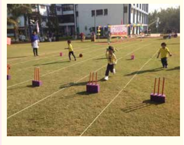
Children enjoyed sports activities and experienced 'Run in the Sun' is so much fun.