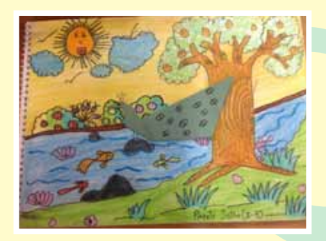
Preeti Sathe 2 B