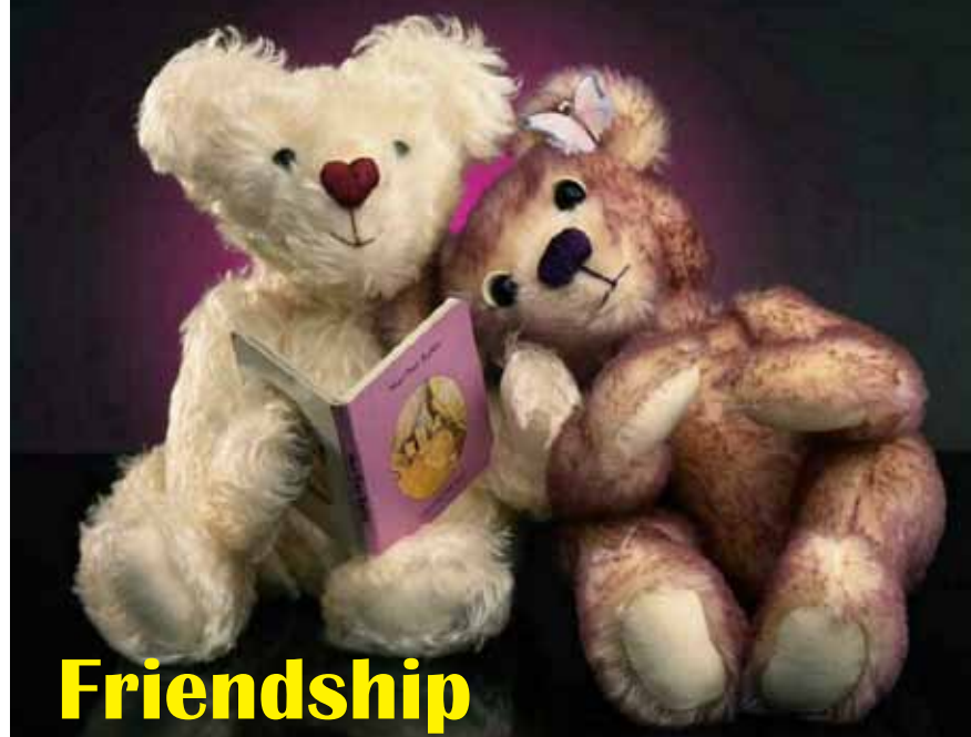
A Podar International School News Monthly

Friendship is a gift for those few who are chosen by God. It flowers in the hearts of those whom God wants to bring together. It is having a good relationship with someone, who we call a friend not for a short term but for long. People in a friendship have respect and affection for one another.