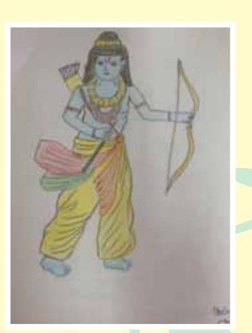
Yash Shinde 6 B