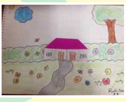
Ruchi Sawant IA