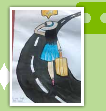
Twinkle Singh VII - Kalam