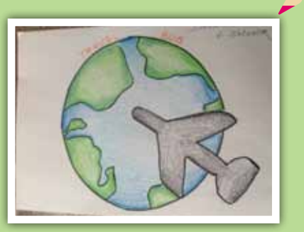
Devshree Wadekar V-Shivalik