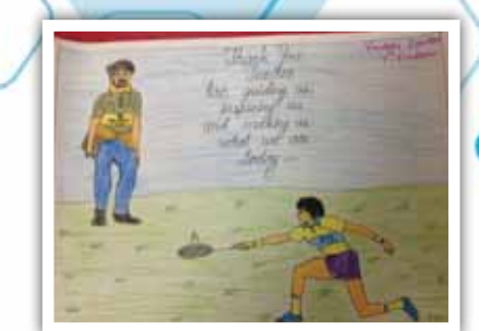
Vaidehi Deokar (7-Einstein)